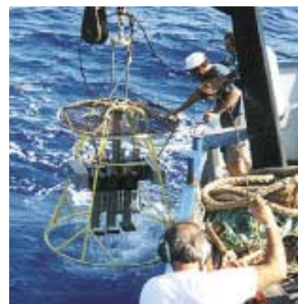
Sampling at sea.

Field experimental studies carried out under Cost-Impact brought to light the complexity of the relationship between demersal fishing effects and changes in biodiversity and